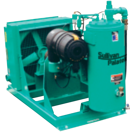
Line Shaft Compressor

GENERAL: Consult factory for options or accessories not listed. Specifications subject to change without notice.